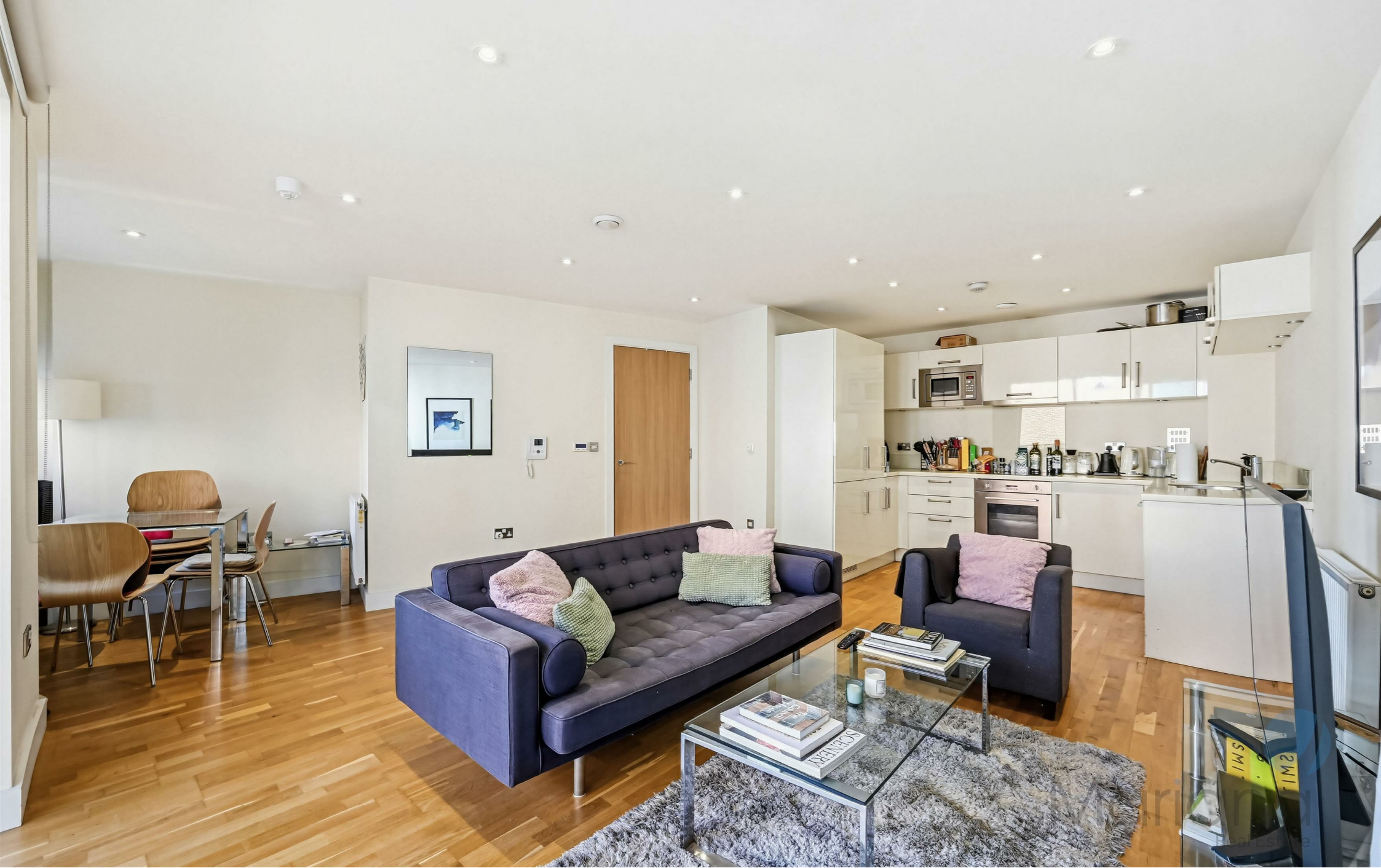
Flat 54 Arc House, 82 Tanner Street London, SE1 3GN £3,000 Per Month